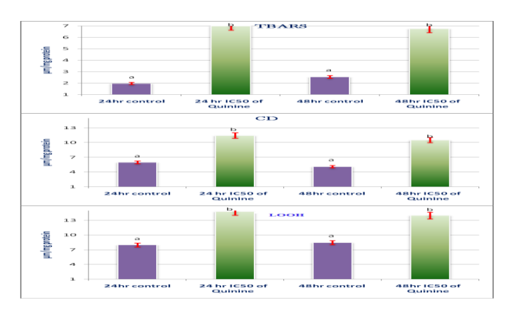
Figure 1: The status of lipidperoxidation in control and Quinine treated KB Cancer cell line.

The results of enzymatic, non-enzymatic antioxidants studied are shown in Fig1, Fig2, Fig3, Fig4.