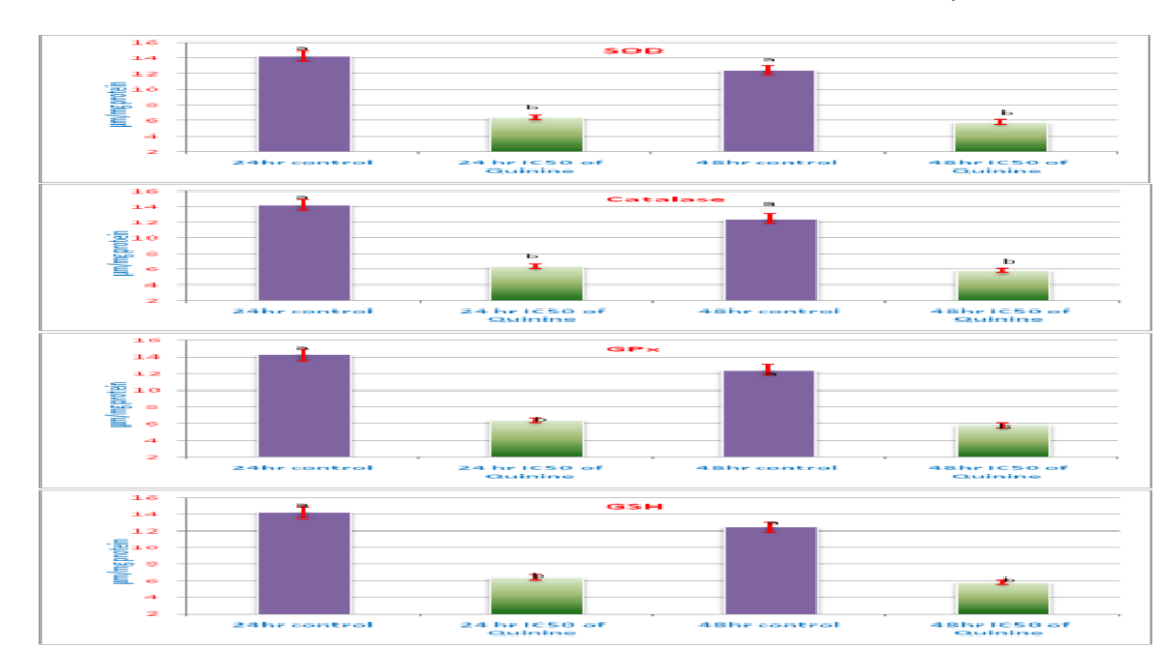
Figure 4: The status of SOD, Catalase, GPx and GSH Levels in control and Quinine treated HEp-2 Cancer cell line.

Values are given as mean ± SD of six experiments in each group. Values not sharing a common superscript differ significantly at P < 0.05 (DMRT).